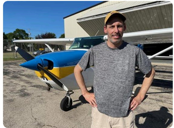
Flying past Green Lake Campground, my dad's favorite place for camping.